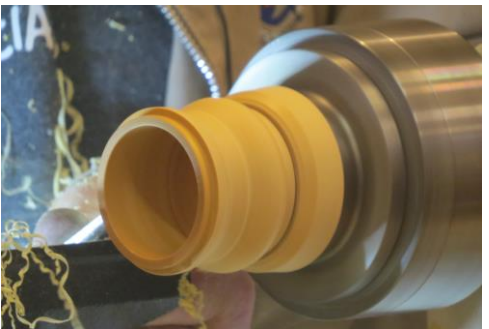
Base of olivewood box being shaped