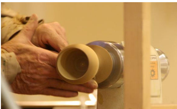
Box hollowed and shaped