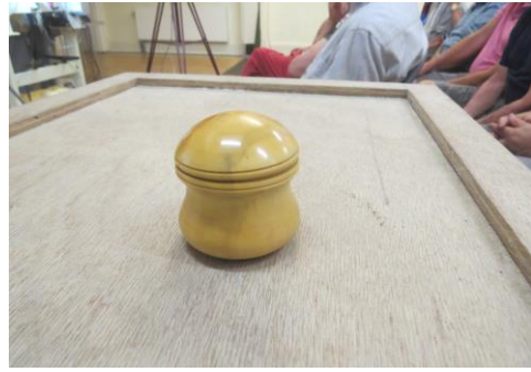
Finished and polished