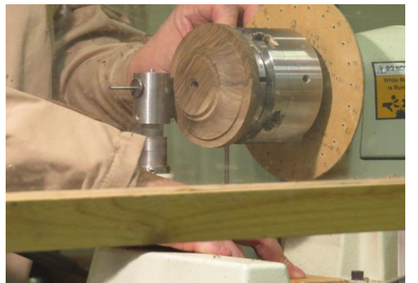
Drilling ear-ring holes using the indexing plate