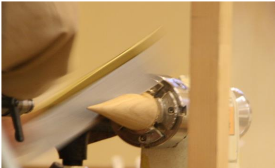
Forming the cone stand