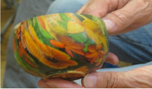
An example of transfer onto sycamore bowl