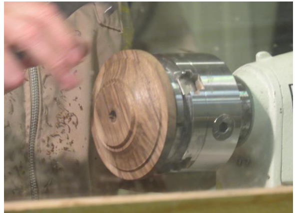
Turning the base of a ring-stand