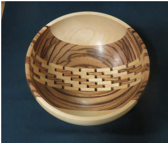
Some of Sue's display items