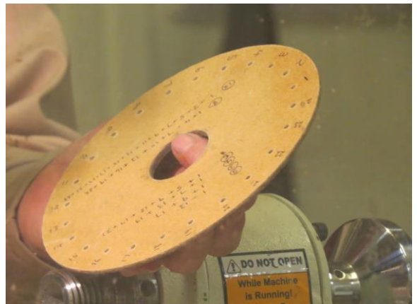
Philip's own design an indexing plate