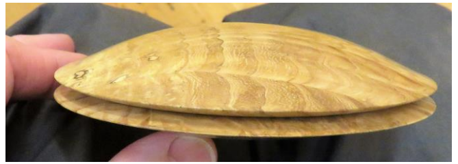
An impressive demonstration making this oyster or clam box