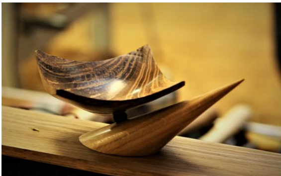
The finished item